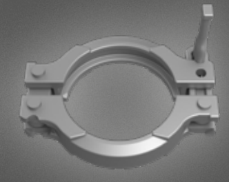
ZX-W wedge coupling for rapid opening